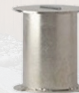
Plate for when bollard is removed