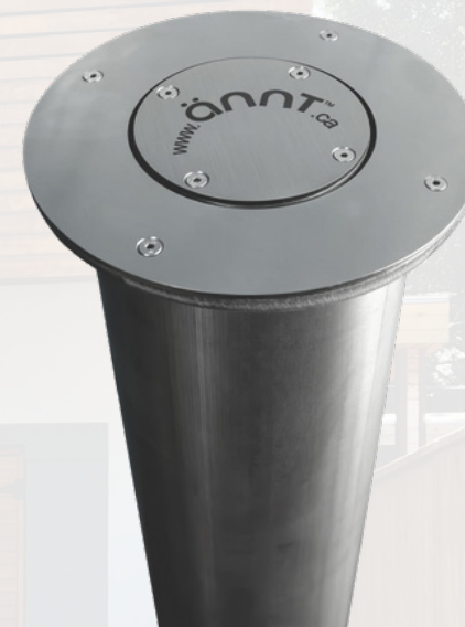
Top view of bollard (in down position)